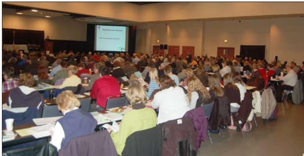
Southern Illinois District delegates met and voted at the Gateway Convention Center in Collinsville.