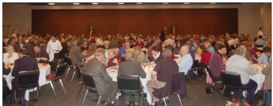
Participants and guests enjoy fellowship during their meals at the convention.