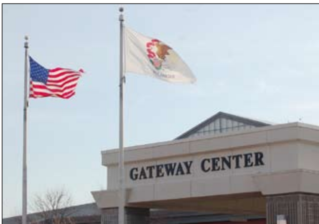
The Gateway Convention Center in Collinsville, the site for the Southern Illinois District 55th regular convention.