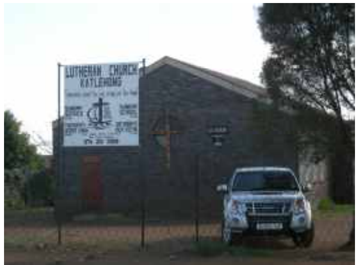
Lutheran Church in Katlehong